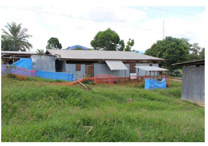
Commemoration column for hospital staff in Kenema. The facility in Kenema district