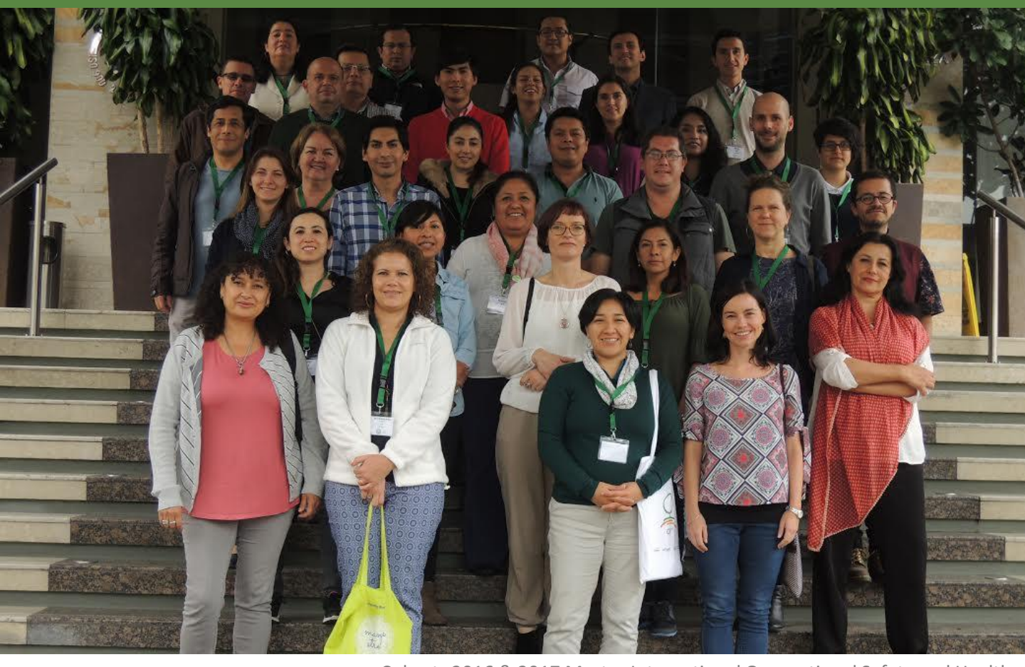
Cohorts 2016 & 2017 Master International Occupational Safety and Health

International Occupational Safety and Health -Onsite courses 2017